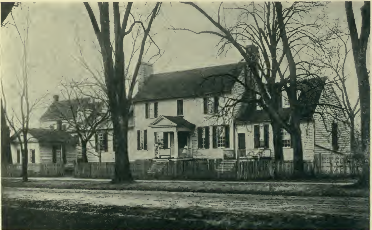
TUCKER HOUSE, WILLIAMSBURG, VIRGINIA

Long dormers with sharp-peaked gables are characteristic of the early Southern houses